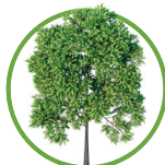
TREES & SHRUBS